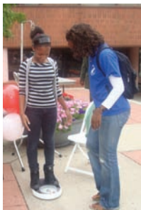
Below: Health related activities during York Fest