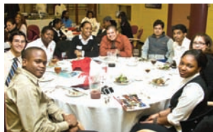
Many students attended the event